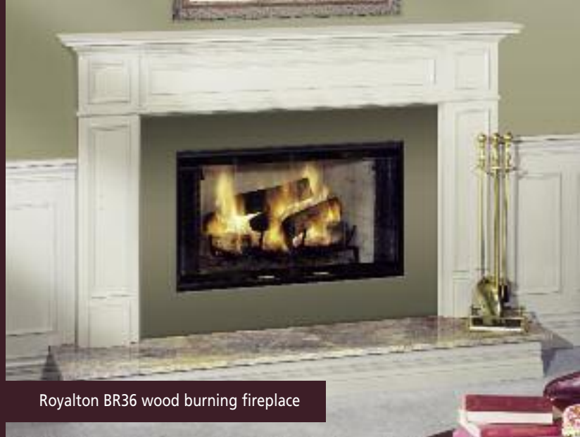
Royalton BR36 wood burning fireplace