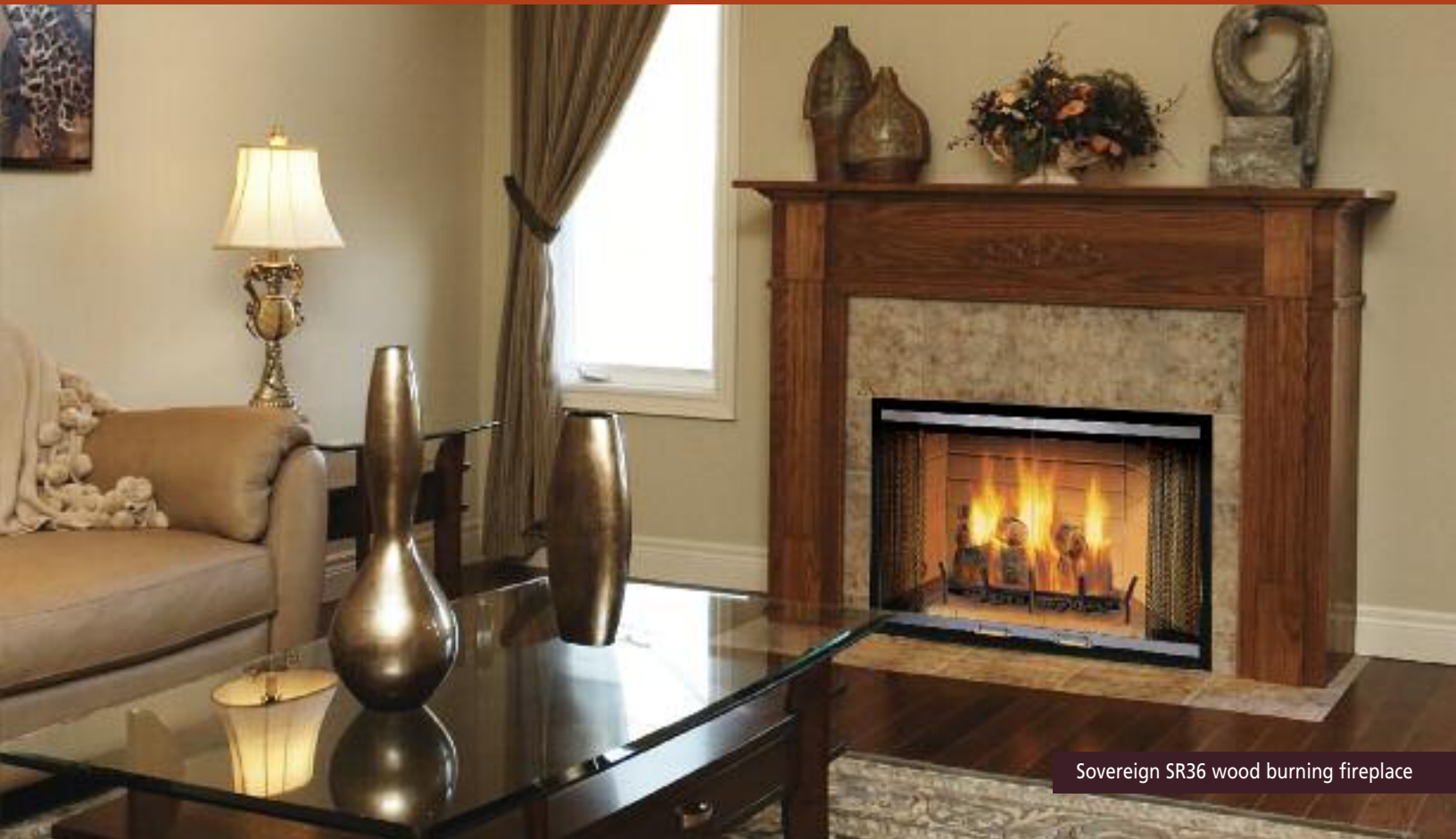
Sovereign SR36 wood burning fireplace