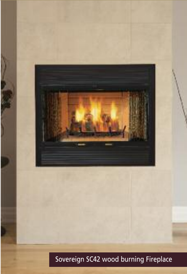
Sovereign SC42 wood burning Fireplace

Add the traditional look of a wood burning fireplace to any room in your home with the Sovereign wood burning fireplaces from Monessen. This classically styled fireplace is available in both radiant and circulating face models and in both 36 and 42 inch sizes. The Sovereign offers a fully refractory-lined firebox and classic brick pattern hearth for easy ash clean up. Styled with an ash lip, large heavy duty grate, cast iron flue and black mesh fire screen, the warmth and unobstructed view of this classic fireplace will create a focal point for your home.