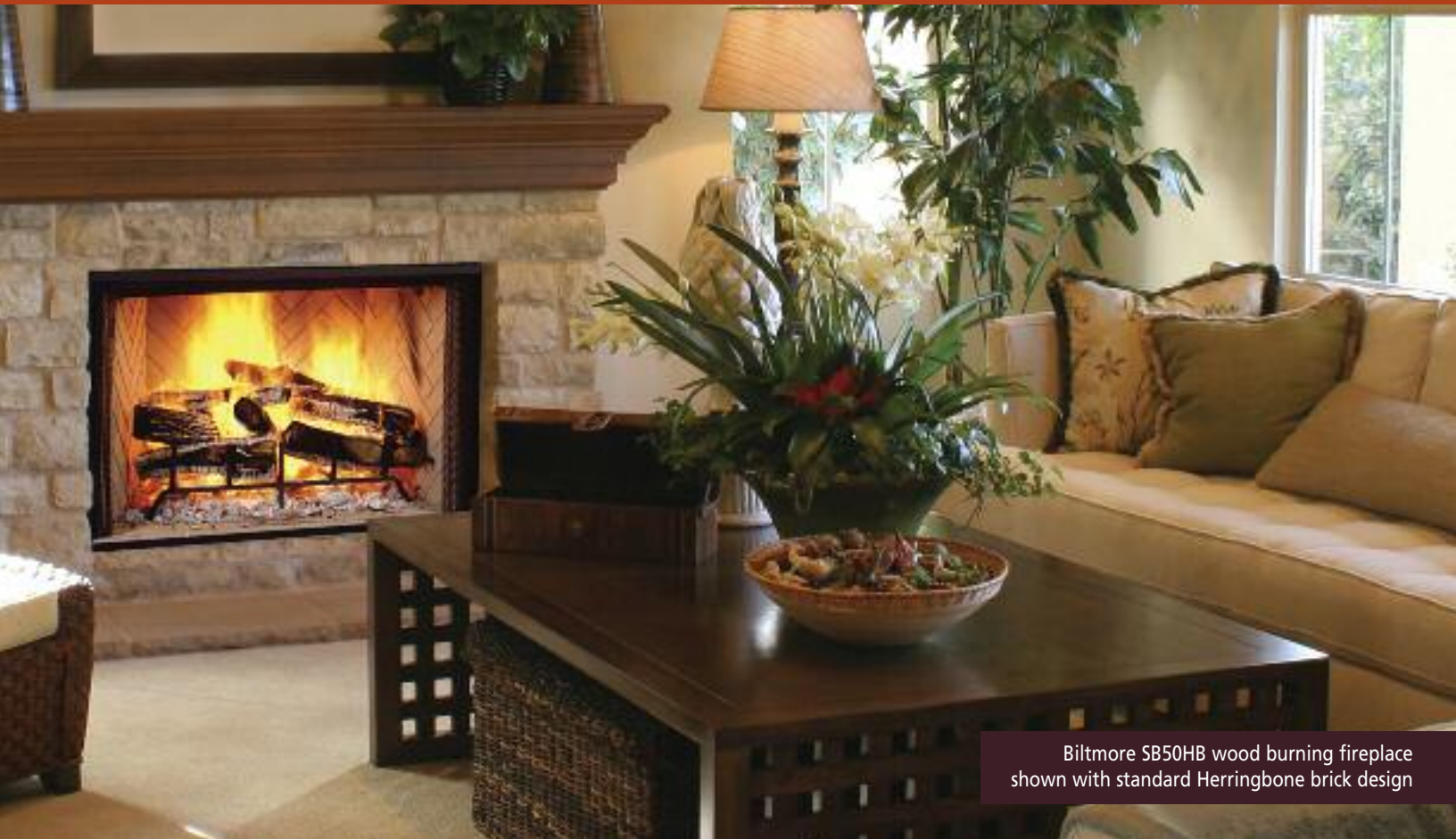
Biltmore SB50HB wood burning fireplace shown with standard Herringbone brick design