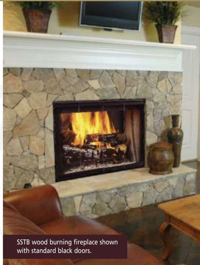
SSTB wood burning fireplace shown with standard black doors.