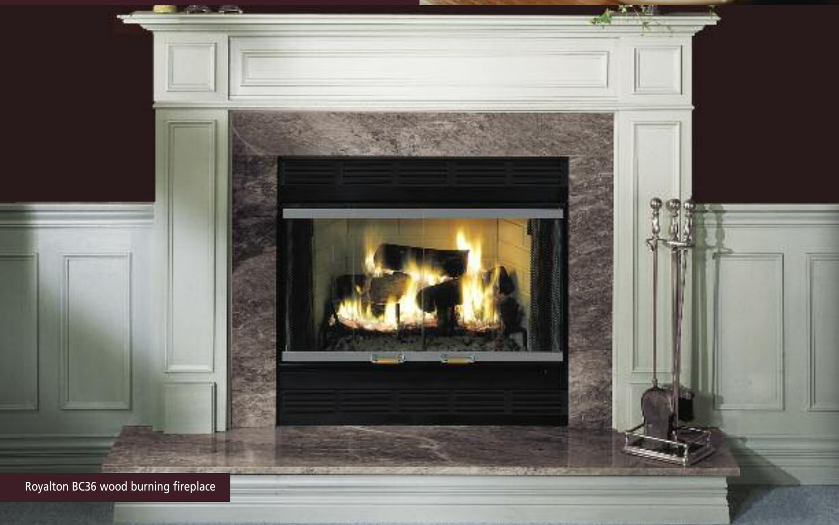
Royalton BC36 wood burning fireplace