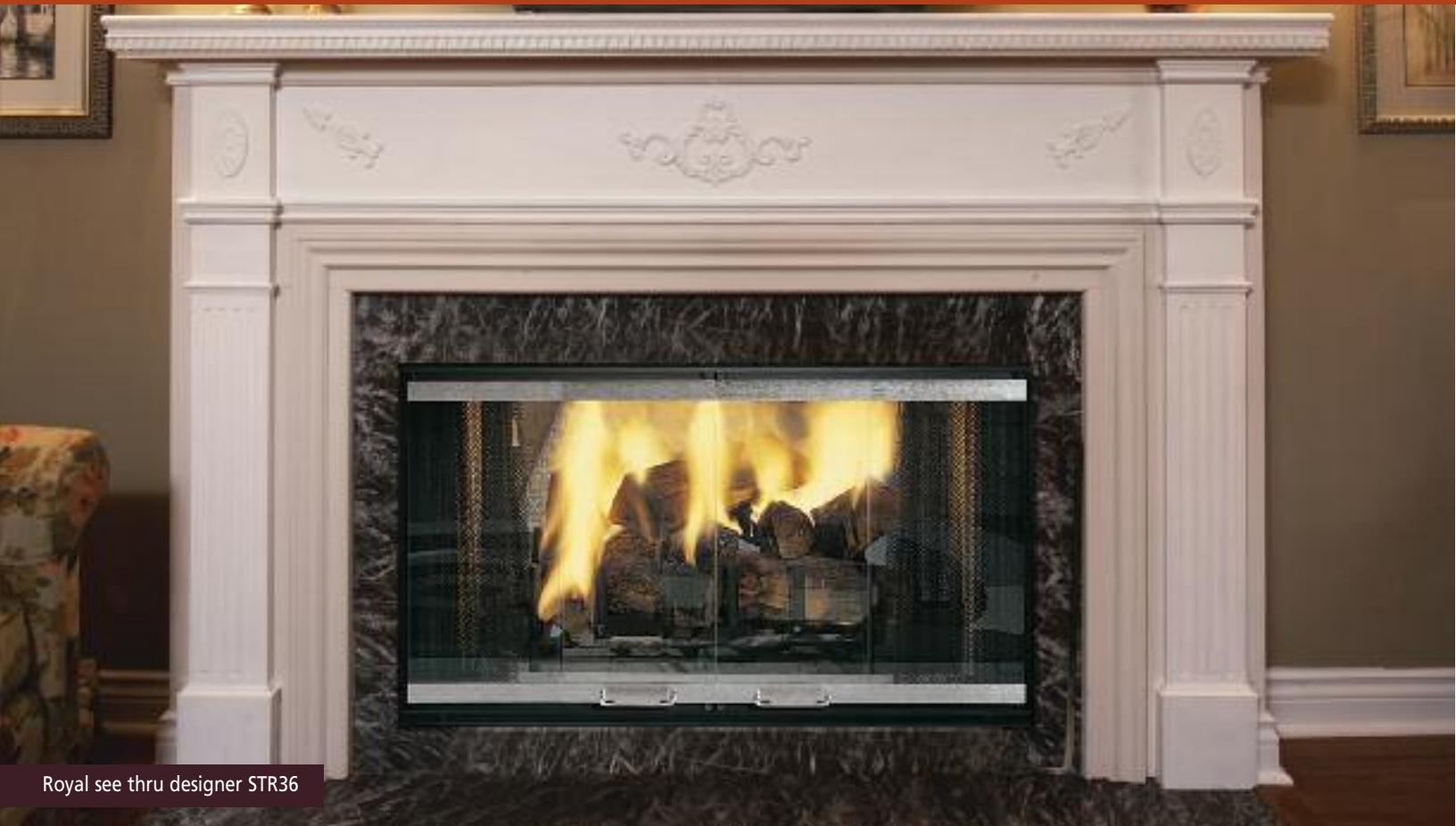
Royal see thru designer STR36