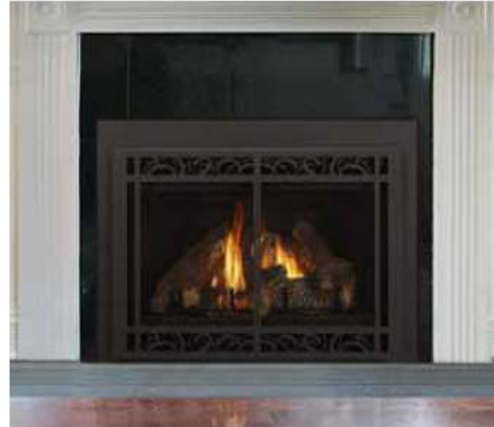
NDI35 shown with Cabinet front in black and steel refractory kit.