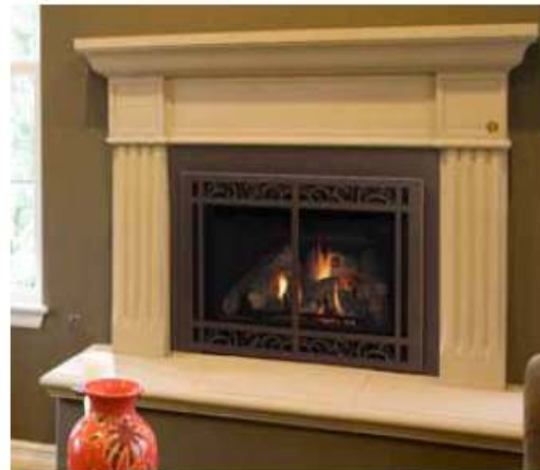
NDI30 shown with Cabinet front in bronze.