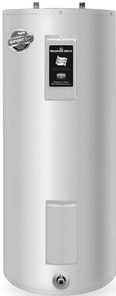
Photo is of M-2-50T6DS